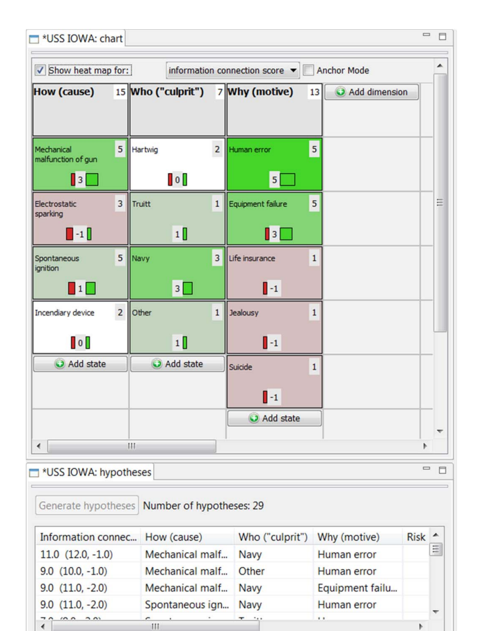
Fig. 5. Screenshot of a morphological model and generated hypotheses. Heatmap is enabled, visualizing to what extent evidence supports and contradicts the conditions of the morphological model. The score (far left column of the hypothesis list) give the total score for each hypothesis (#supporting evidence – #contradictory evidence).